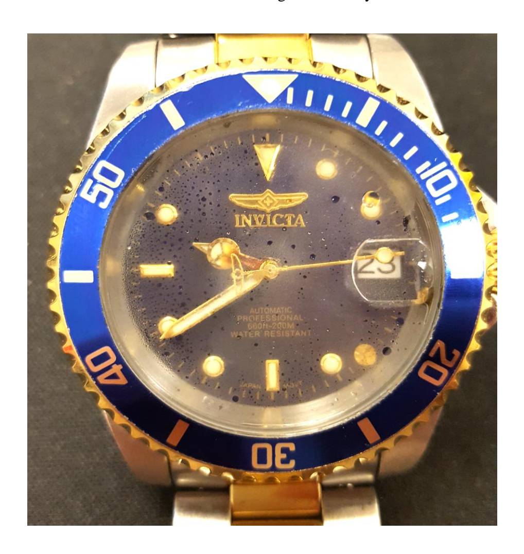
Widespread Reports of Leakage